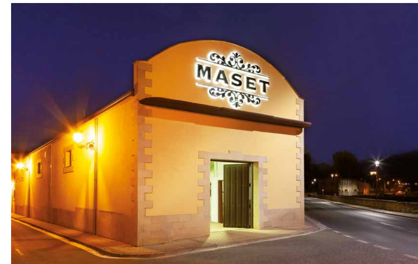
Main entrance of our winery in La Rioja.