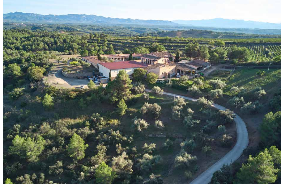
Aerial view of Mas dels Freres, the building surrounding our Priorat winery.

At Maset, we have our own wineries in Penedès, Priorat and La Rioja, three of the most important and exceptional winemaking zones in the Iberian Peninsula. This strategic display facilitates the exchange of technique, knowledge and experience among territories, improving day-to-day operations at each of our production centres.