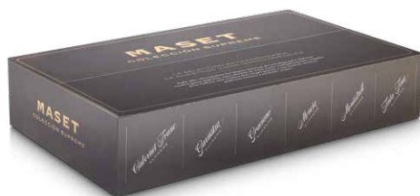
5037 - Packaging in box of 6 bottles of 75 cl

From a selection of our best barrels of monovarietal wines, we create our Supreme line: six red wines carefully selected to undergo 12 months of ageing in French oak barrels and 6 months of refinement in large-volume wooden vats. This mixed ageing lets us round out its tannins, gain complexity and maintain its fruity expression intact.