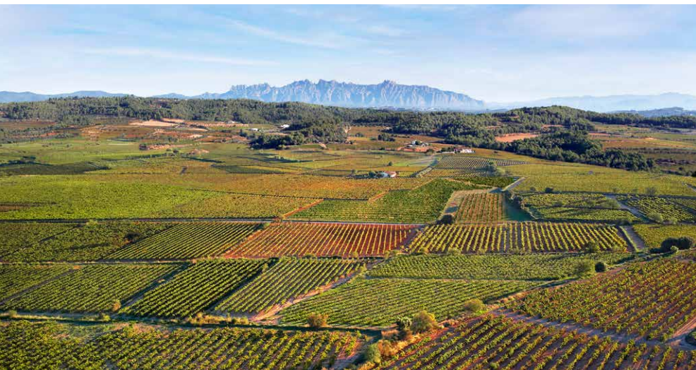
Panoramic view of the Teuleria dels Àlbers vineyards with a backdrop of the Montserrat range.

In 2012, we achieved our dream of creating a winery project integrated into La Rioja's natural environment. The winery is located in Haro's historic Barrio de la Estación district, at number 1 Costa del Vino Avenue, vital centre of the Rioja Qualified Designation of Origin. From this privileged position, we make all our wines, betting on traditional procedures without closing the doors to new techniques that offer quality improvement. A work philosophy that adheres to the firm commitment to conserve the vineyard landscape and the cultural patrimony of this internationally renowned zone.