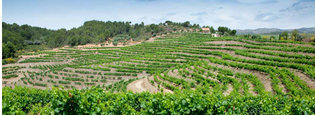
The Solanes del Molar estate banks in the DOQ Priorat.

Singular homelands that unite with a thousand-year-old tradition. Each of our winery's estates enjoys a unique climate and the particular edaphological and geological conditions that make every one of our wines stand out.